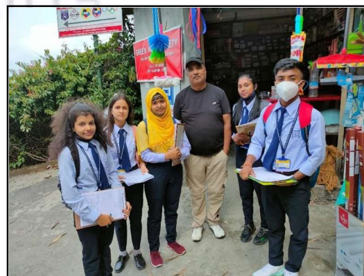
Field Photographs at Kalimpong District (May- 2022)