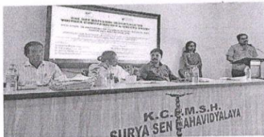
STATESMAN NEWS SERVICE

A national level workshop on Vulture Conservation & Nature Study was organized by the Eco Club and Department of Environmental Studies of Surya Sen Mahavidyalaya in the college campus here today.