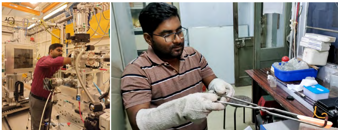
Sample loading in Elettra Sincrotrone Trieste (left) and sample preparation (right) by the Project Fellow.